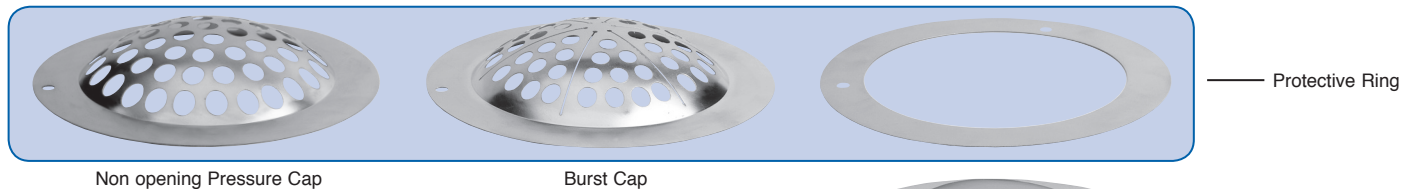
Non opening Pressure Cap